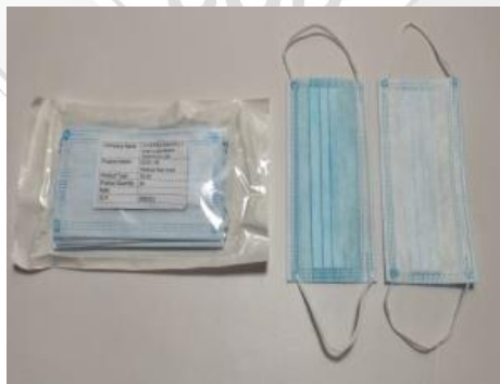
Photo of Samples

Note: Pass = Meet customer requirements; Fail = Fail customer requirements; # = No comment; N.D. = Not detected.